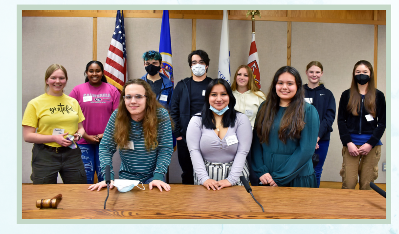
Above: The inaugural Youth Commission meeting.