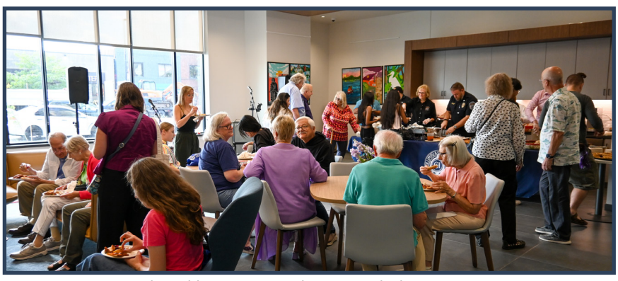
Astronomy Town played live music in the Central Place Community Room while food was served from Adama Restaurant, Jasmine Thai, and Pizza Man.